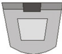
Tail End View