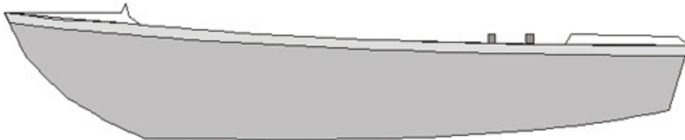
Hull, gunwale, fore-deck, rear deck

Please note that available colours are on the FGI colour charts shown on our website ( www.dkgsurfboats.com ).